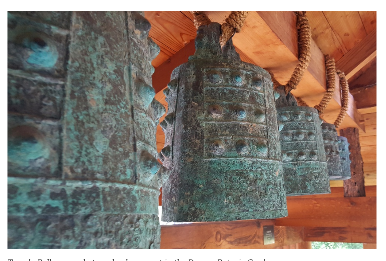
Temple Bells somewhat randomly present in the Denver Botanic Garden.

The gardens were lovely and I had a great time wandering around, taking a million pictures (almost none of which came out; pretty much my normal), having a snack, and enjoying the morning.