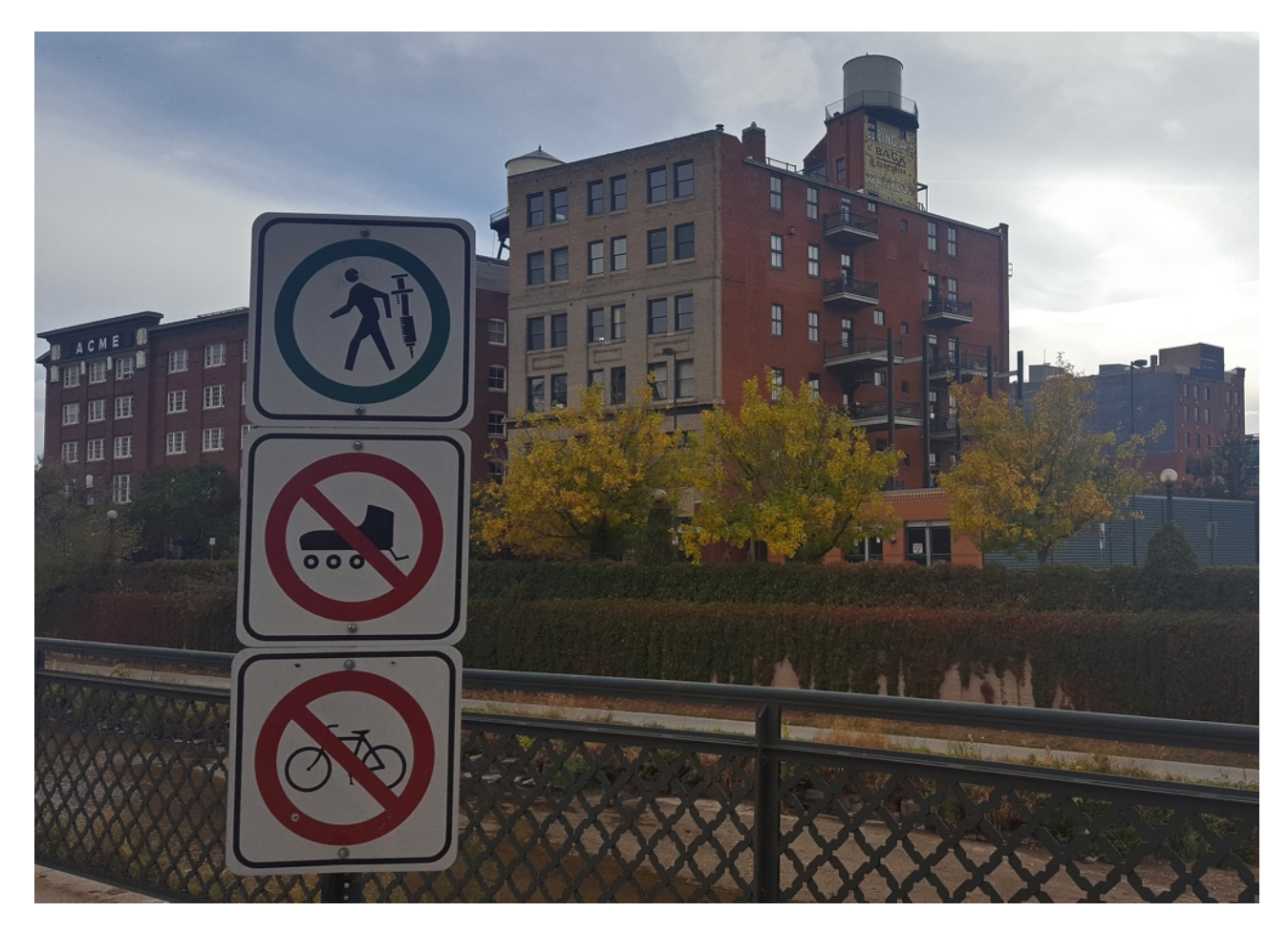
Enhanced sign. ACME warehouse. Parking lot where I locked the keys of my scooter into my scooter's top case.

Ah, that invigorating moment when you stride up to your scooter and reach down to find an empty pocked where your keys should be. No worries! I have a spare key! Stashed in my jacket which I usually take with me and this time I locked in the top case.