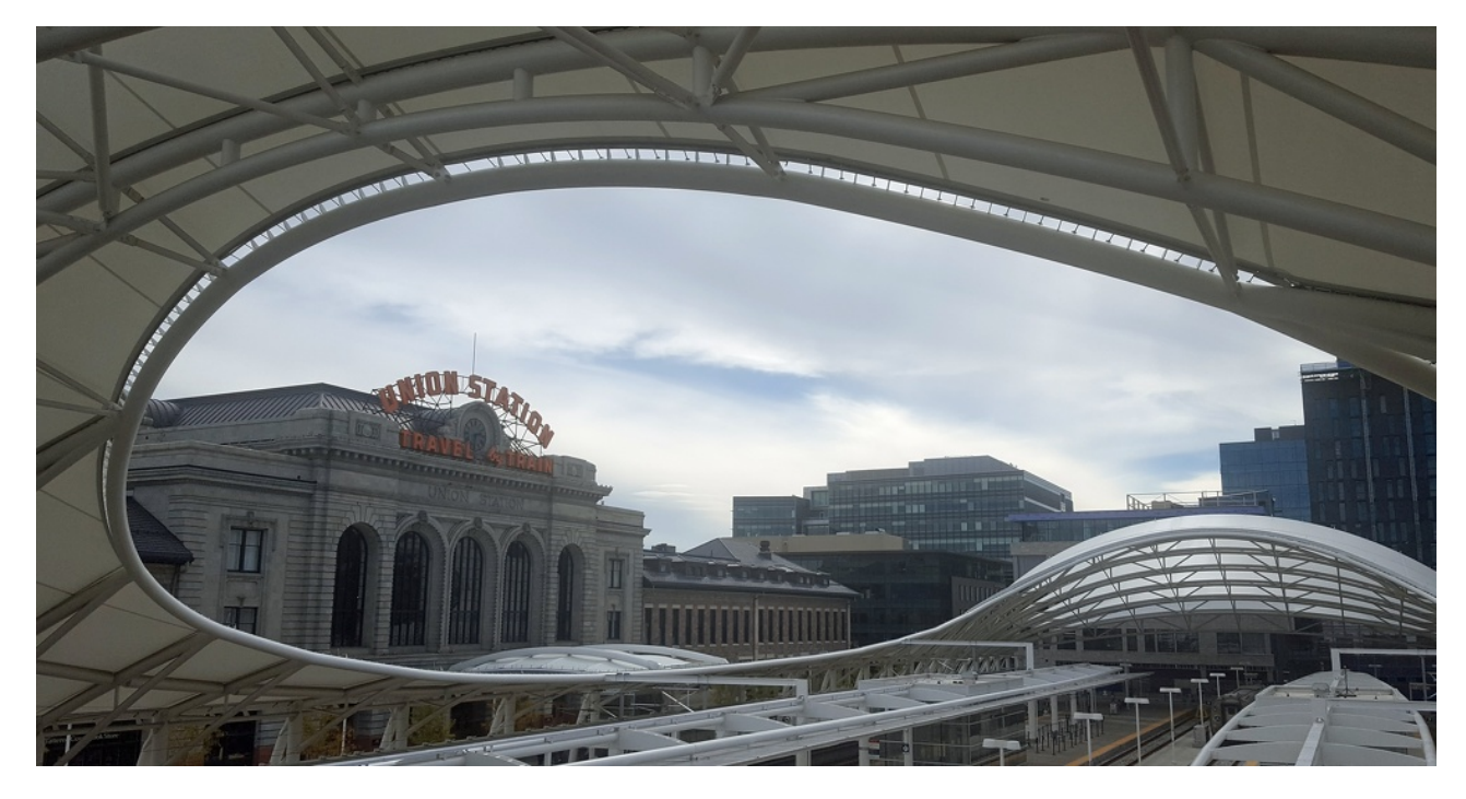
Union Station is cool.