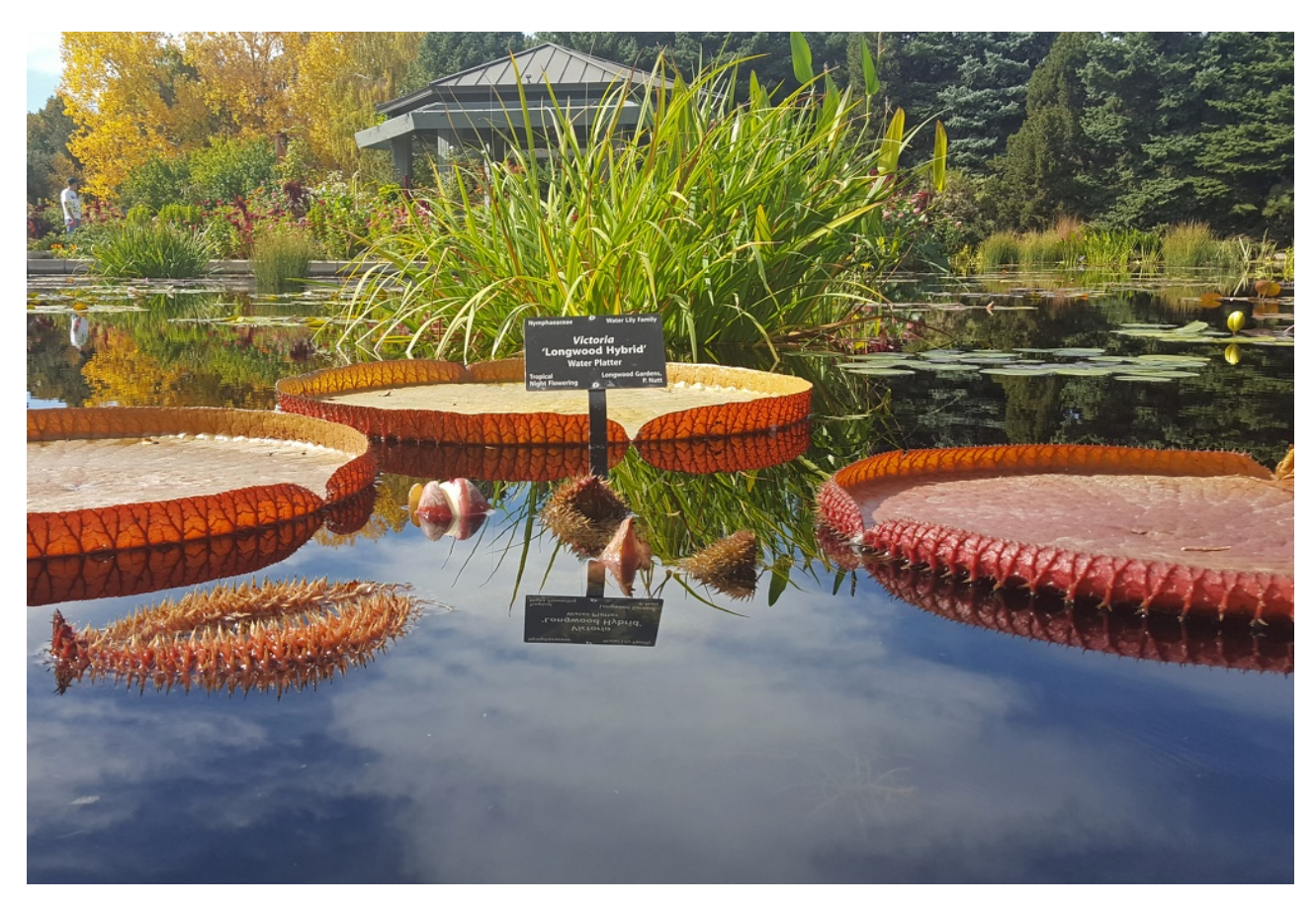
I'm a huge fan of these crazy Victoria Platters. The water looks a bit strange because the folks who run this place add black die both to make it look cool and reduce fungal growth.