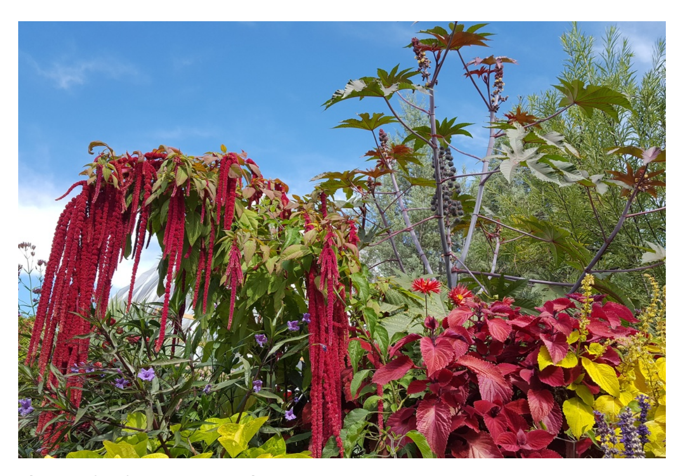
Oh, some of my favorite Dr. Seuss plants!

A lovely morning and still time in early afternoon to check out Union Station.