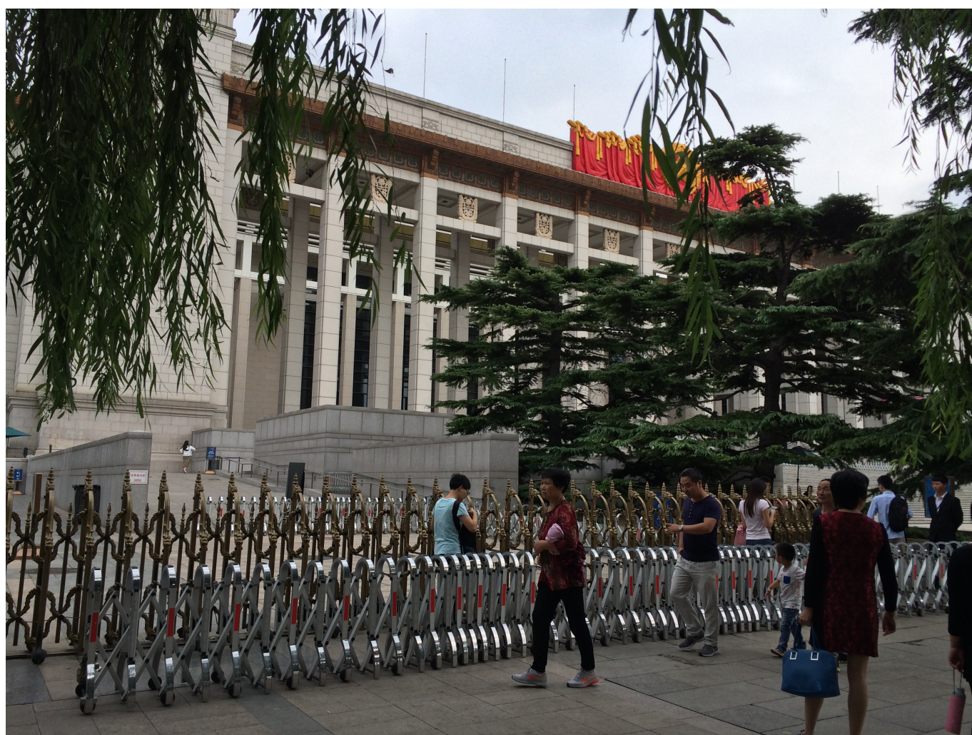
Entrance to the National Museum of China

This Sunday I took the subway to Tiananmen Square and visited the National Museum of China. The entrance of the museum was a little tricky to find because I can't read the signs yet and there was a maze of railing up around the museum directing us to the entrance.