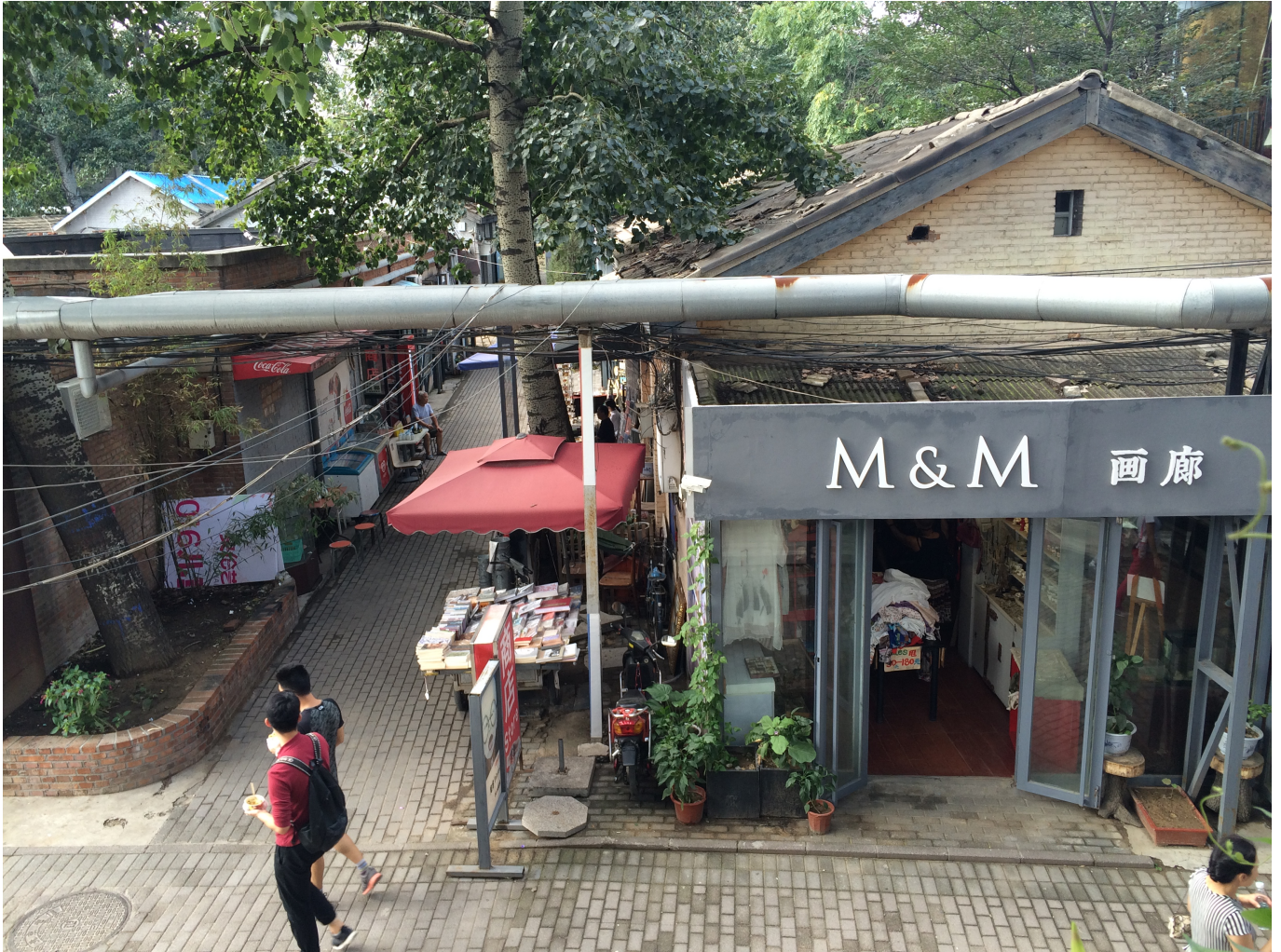
798 Art District from the balcony of a coffee shop.

We also visited the Yonghegong Temple (Lama Temple) which houses a large Buddha carved out of a single tree.