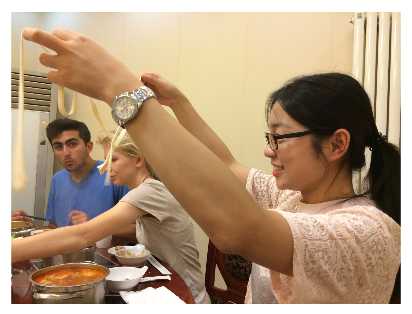
My teacher stretching a noodle before adding it to a steaming pot of broth.

So it's not all work here. We go on excursions too. After our first exam we had hot pot for lunch. Then we went to the Summer Palace which is located within a huge park in Beijing.